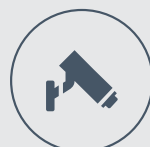
HLS & Transportation